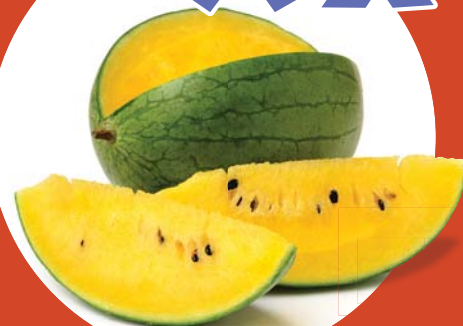
Xigua Chinese Watermelon